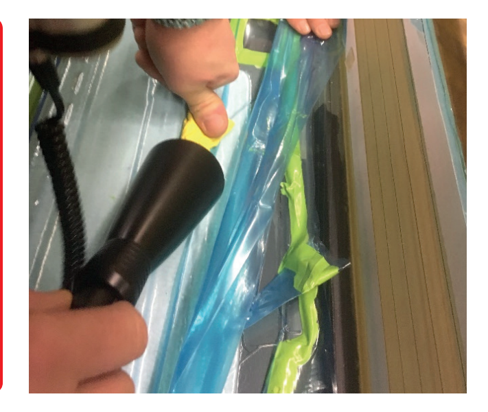
Figure 2: Sealing a leak after precise localization

Directional Tube with tip: Shields against other ultrasound sources and enables exact localization of the leak