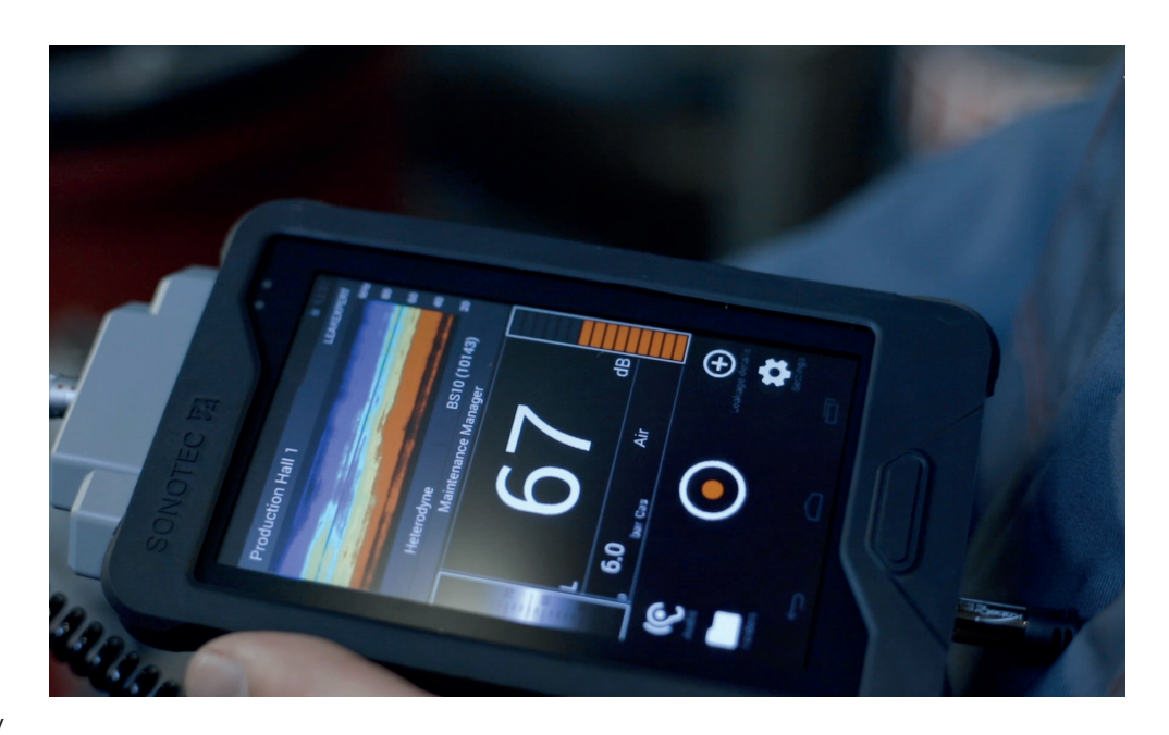
Leaks are broadband phenomena as the LeakExpert app on the SONAPHONE easily demonstrates

Because leaks emit broadband ultrasound, it is possible to find them with a 40 kHz detector. However, the 40 kHz probes can also pick up a great deal of interfering ultrasonic signals. New broadband sensors with very sensitive ultrasonic microphones and high sampling