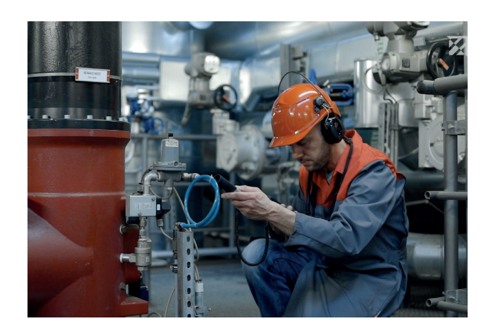
Detection of leaks on a compressed air line with the SONAPHONE

when searching for a leak. Earlier ultrasonic detectors use piezoceramic probes, which are resonant in a very small frequency range around 40 kHz.